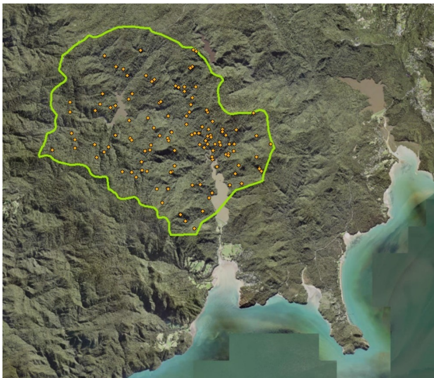
Figure 6-1. Map showing point locations of 125 soil samples collected from an area (inside the polygon) of the Waitākere Ranges Regional Park containing an estimated 12,680 kauri trees where P. agathidicida was not detected during the 2021 Waitākere Ranges survey.